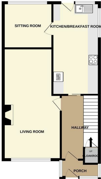
GROUND FLOOR 597 sq.ft. (55.4 sq.m.) approx.